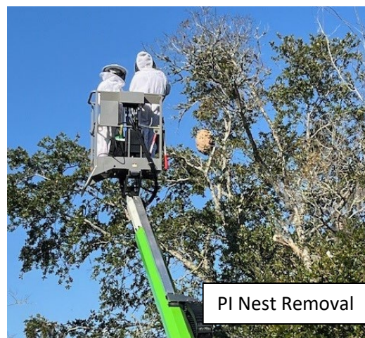
PI Nest Removal

In August 2024, the presence of the YLH was confirmed on Parris Island. Environmental and Pest Control staff have partnered with Clemson University to monitor and eradicate populations aboard Parris Island. This monitoring is conducted using a series of hornet traps set across the island. In October, the first nest was located and removed. Staff will continue to conduct trap checks and take necessary actions.