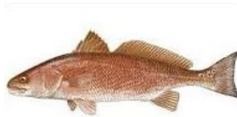
Redfish (Red Drum)

Fish species present in the pond likely include: